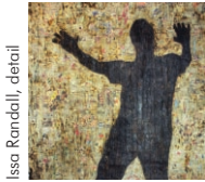
Issa Randall, detail